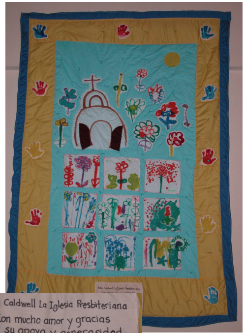
Para Caldwell La Iglesia Presbiteriana Con mucho amor y gracias por su apoyo y generosidad. De los niños, las familias y el personal del Preescolar Bilingüe de Caldwell