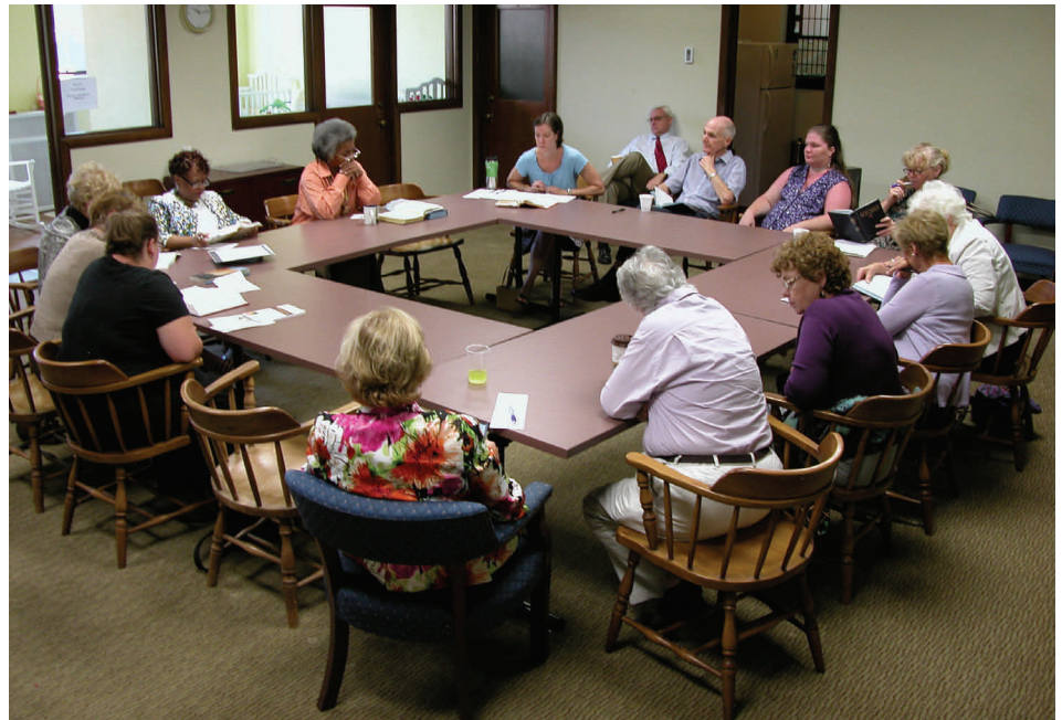
Adult Sunday school members discuss the Book of Ruth during the first of many weeks of classes devoted to women in the Bible. The class is open to women and men.

One such story is of Ruth, a short four-chapter book from the Old Testament . Ruth is the daughter in