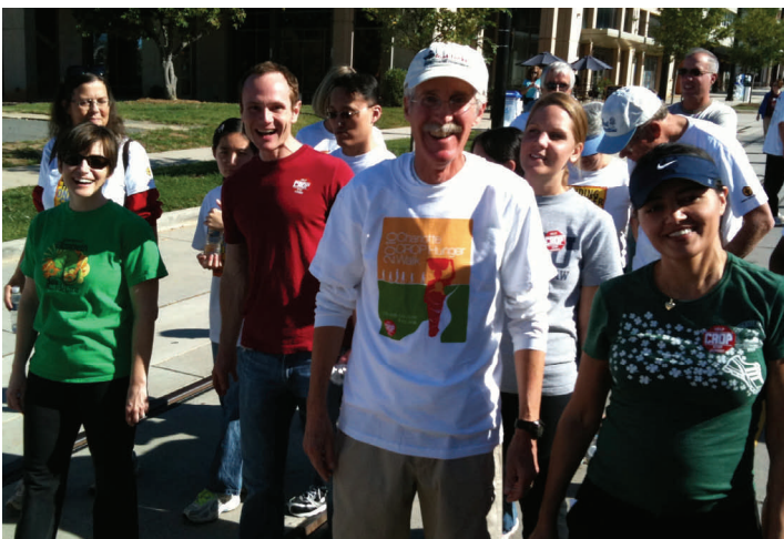
Caldwell's CROP walkers in 2010 had a great time hoofing it for a good cause - and they raised a lot of money to boot.

The total operating budget for the year is $315,000. While we remain cautious, we are hopeful that our ministries and committees will be fully funded by the end of the year. Thanks be to God!