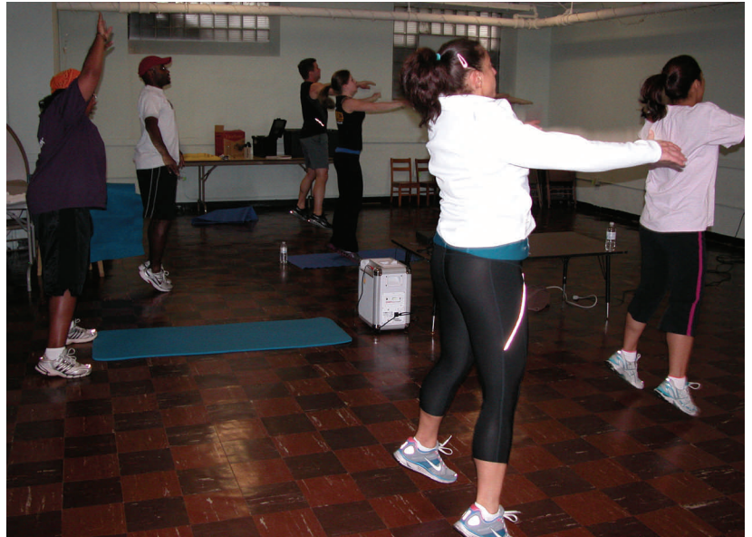
Come as you are - physically and mentally. FitClub fans get in their reps at a self-regulated clip. Many took short time outs, and there is no one-speed-fits-all approach.