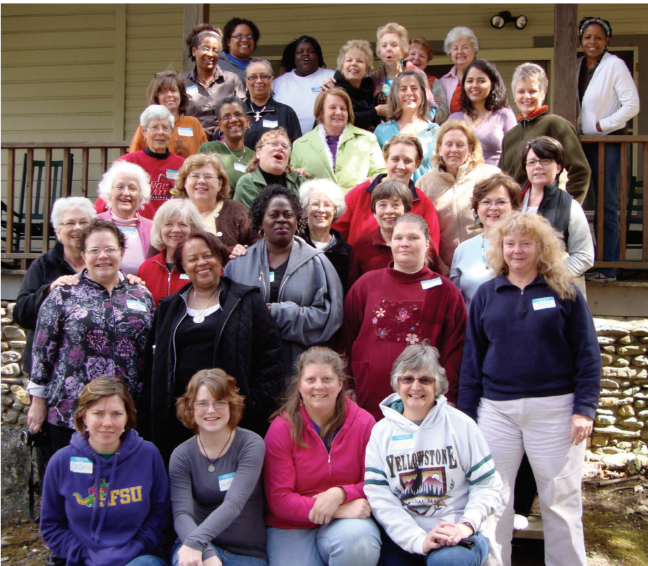
A packed house united. Women’s retreat attendees pose momentarily during a jam-packed weekend of activities. The Lookout Lodge wasn’t the only place nearly stretched to capacity. The women stretched their boundaries, too.