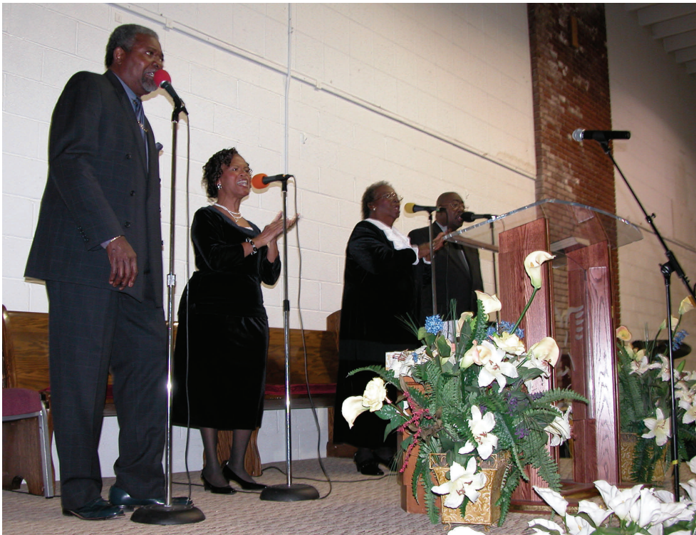
Just like the church next door, music is a major ingredient in the services of Bread of Life ministries.