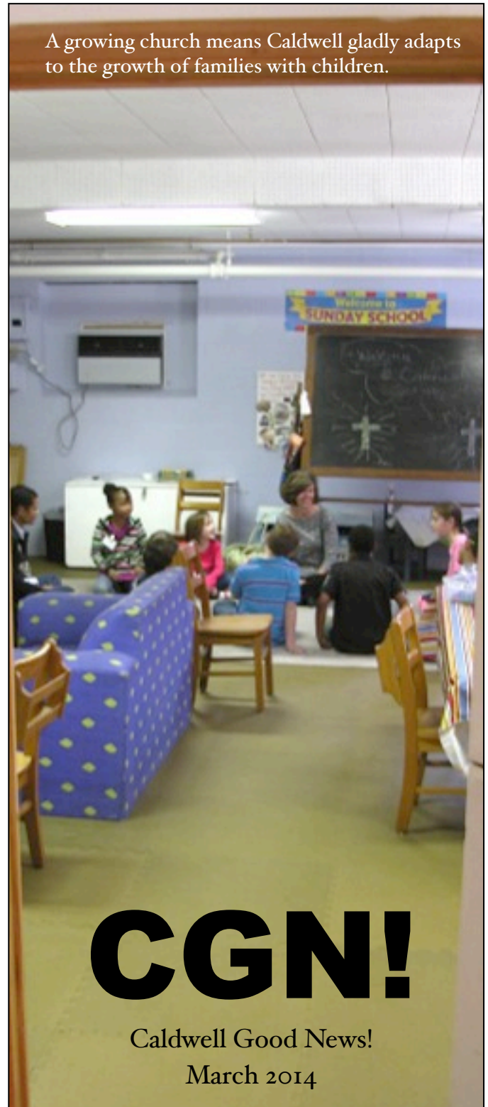
A growing church means Caldwell gladly adapts to the growth of families with children.