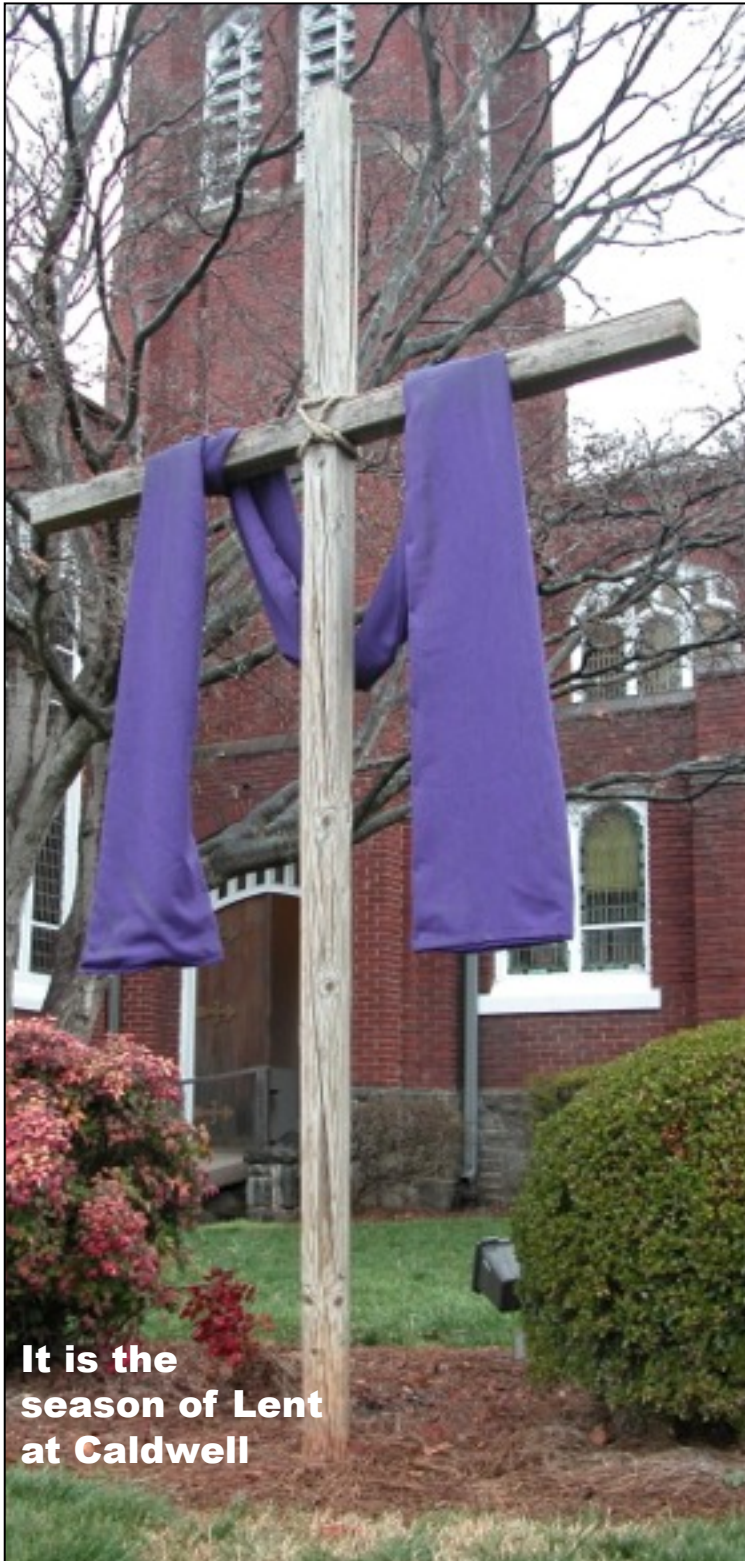
It is the season of Lent at Caldwell