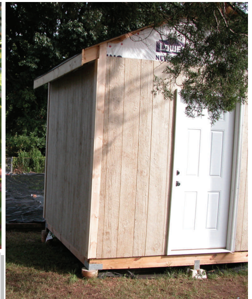
Caldwell's garden plot is prepped for the planting season next spring (although one green pepper plant refuses to go quietly into the winter). Katy Hill says "Come spring we will give Caldwell members a chance to be good stewards of our earth and lay claim to a community garden plot, sharing a part of the abundant harvests that follow with neighbors in need." The garden shed is done, too.