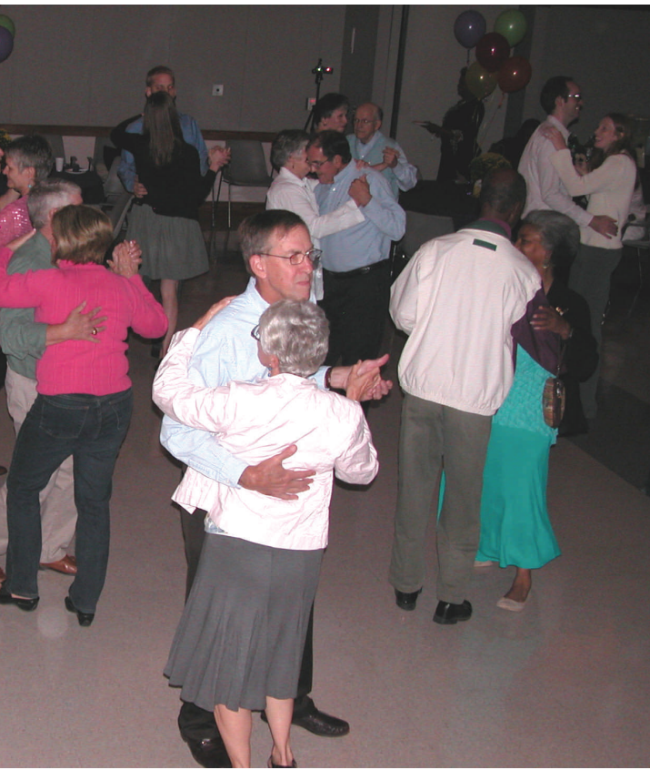
...nn and the Riviervas at the celebratory dance on the first night ...g also included hors d'oeuvres, desserts and a silent auction.