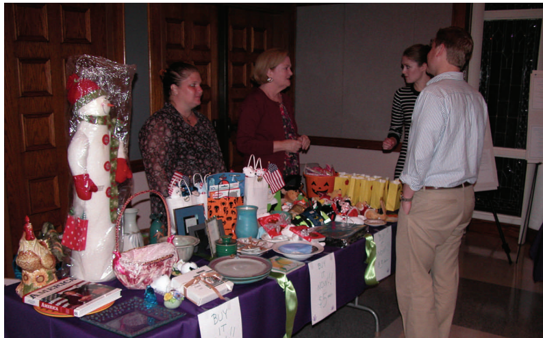
Visitors (below) had a chance to purchase a variety of items with the proceeds to benefit Caldwell.