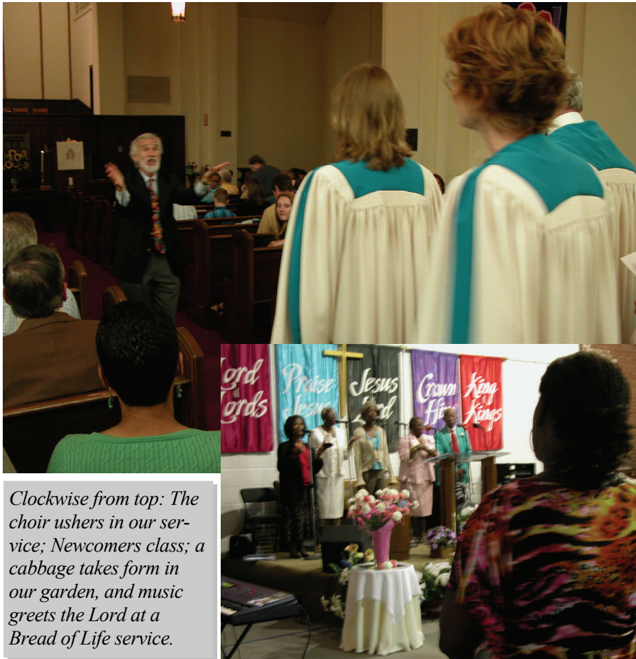
Clockwise from top: The choir ushers in our service; Newcomers class; a cabbage takes form in our garden, and music greets the Lord at a Bread of Life service.