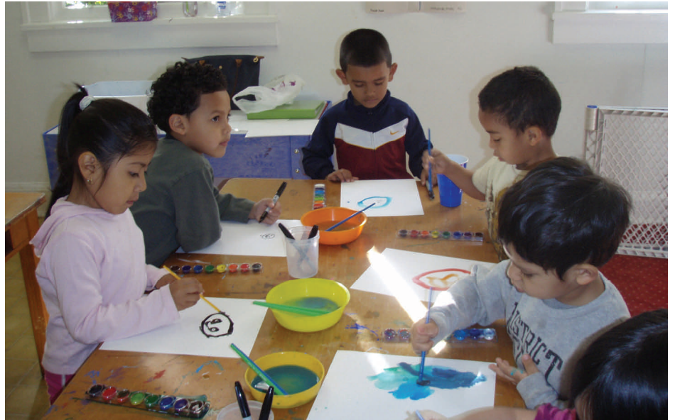
Preschoolers practice their artwork. The school will hold a graduation for 29 students - and their proud parents and relatives - on June 22.