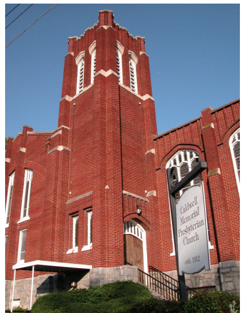
The majestic tower on the west side of our beautiful building stands out in the twilight of a gorgeous summer evening. Don't forget to keep the church in mind in your estate planning. Your kindness will help keep our church campus in good shape.