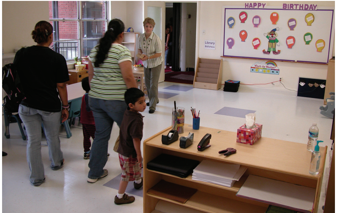
Classroom spaces were spiffed up with new flooring, fresh coats of paint, some new windows, and plenty of school supplies. But the big gift is more useable space to accommodate more children and families. Also in the works: playground equipment.