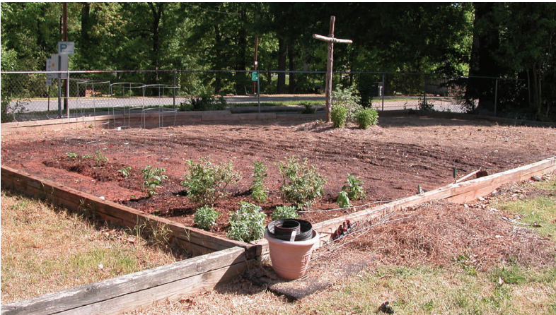
Our victory (over hunger) garden was recently planted behind the church. Volunteers turned out on a nice Thursday to make it happen. Watch for photos next month to see how your garden grows!