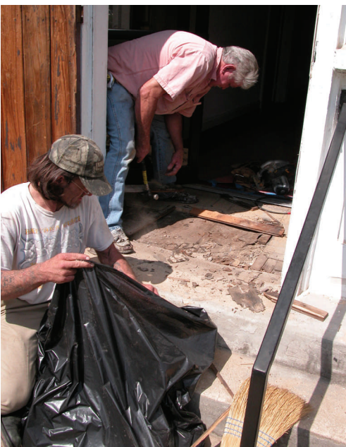
(Left) Workers clear debris from the front entry to the Price Building in preparation for new flooring. Remedial work and other updates, plus a clean up by volunteers, is readying the building for a true educational use - the bilingual preschool will become a tenant. The building may be ready for youngsters in the very near future.