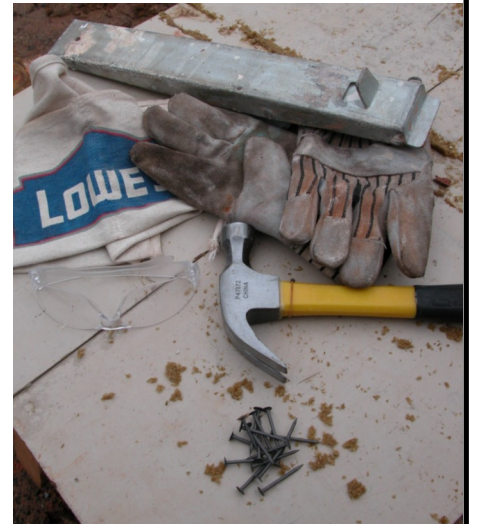
Tools of the trade: tool belts, a lever to lift drywall, sturdy work gloves, safety goggles, nails and a trusty hammer. Not pictured: Caldwell's can-do attitude and caring spirit.