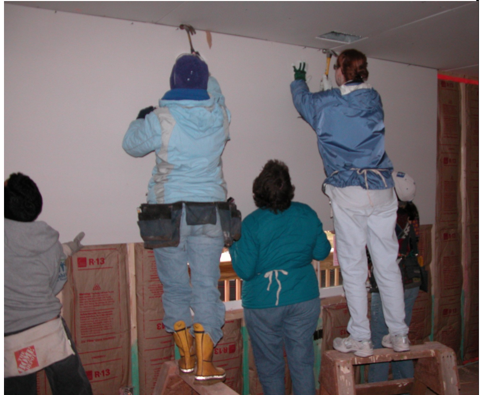
Women stepped up - to hammer a panel into place as their cohorts hefted the drywall panel into position. The large basic panels were installed in relatively short order. It took time to cut and fit various pieces into other open spaces. Note the amount of insulation that will keep the home comfortable all year.