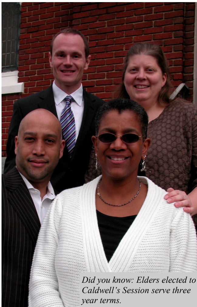
Did you know: Elders elected to Caldwell's Session serve three year terms.